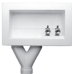
Tornado™ Outlet Box OB-713