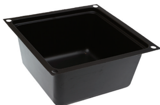
Plastic Tub Box by Benjamin 1313

Tub boxes by Benjamin Mfg. Constructed of high impact plastic. Will not fall apart when exposed to rain or water. Easily cut with utility knife for openings. Rodent proof. Can be used individually or in pairs.