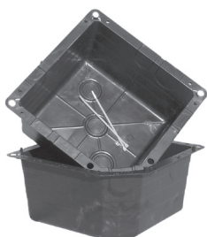
Right-Tite® II Tub Box P-3000