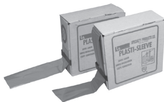
Plasti-Sleeve Pipe Protector